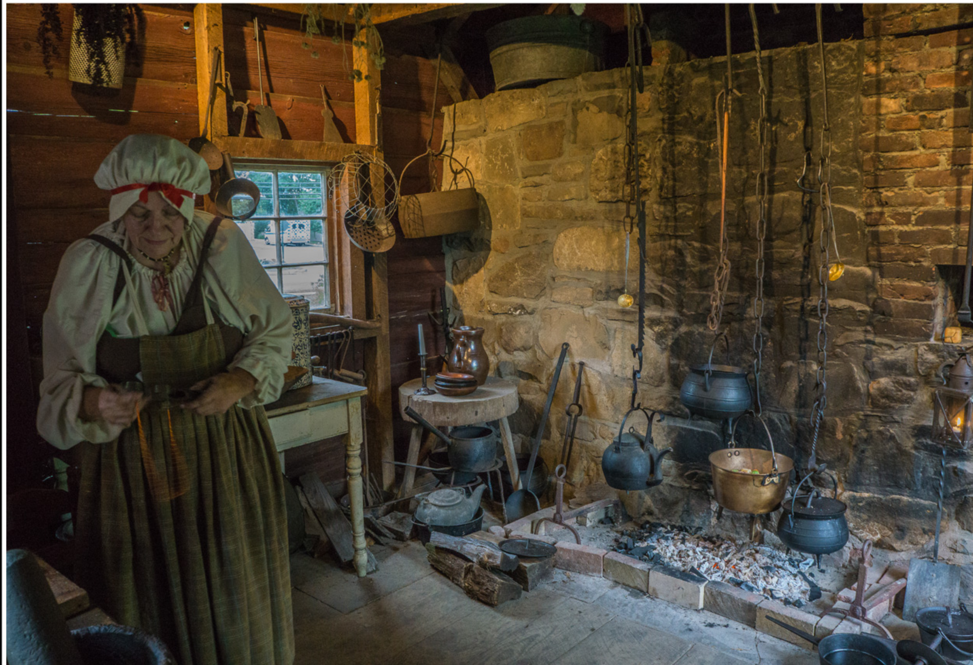
Kitchen: Hopper-Goetschius House Museum