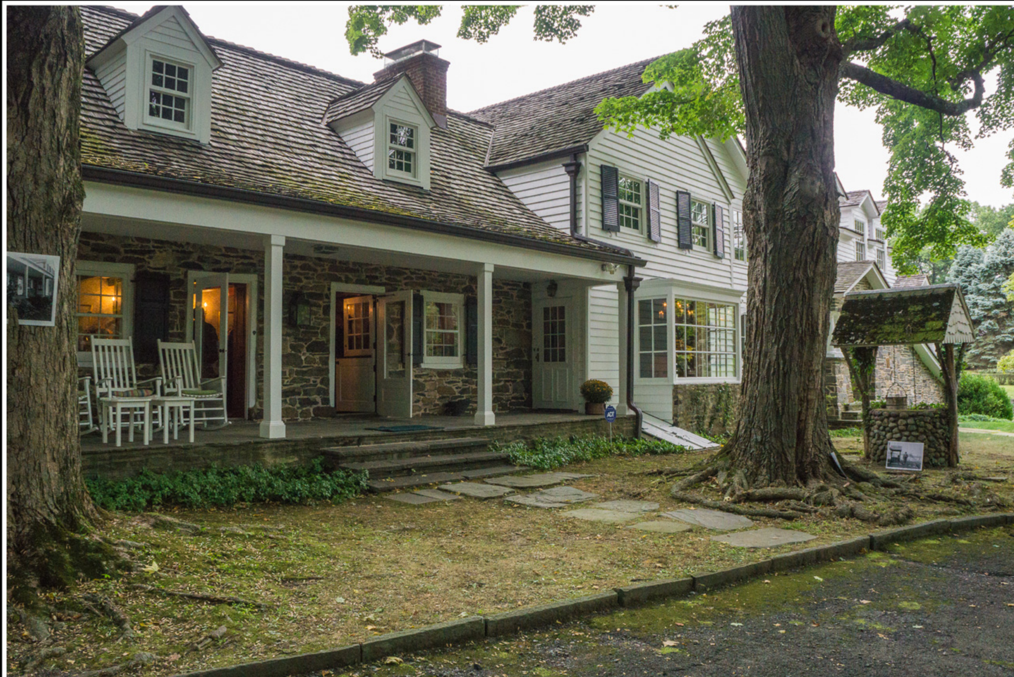
Hennion House (circa 1778), Upper Saddle River