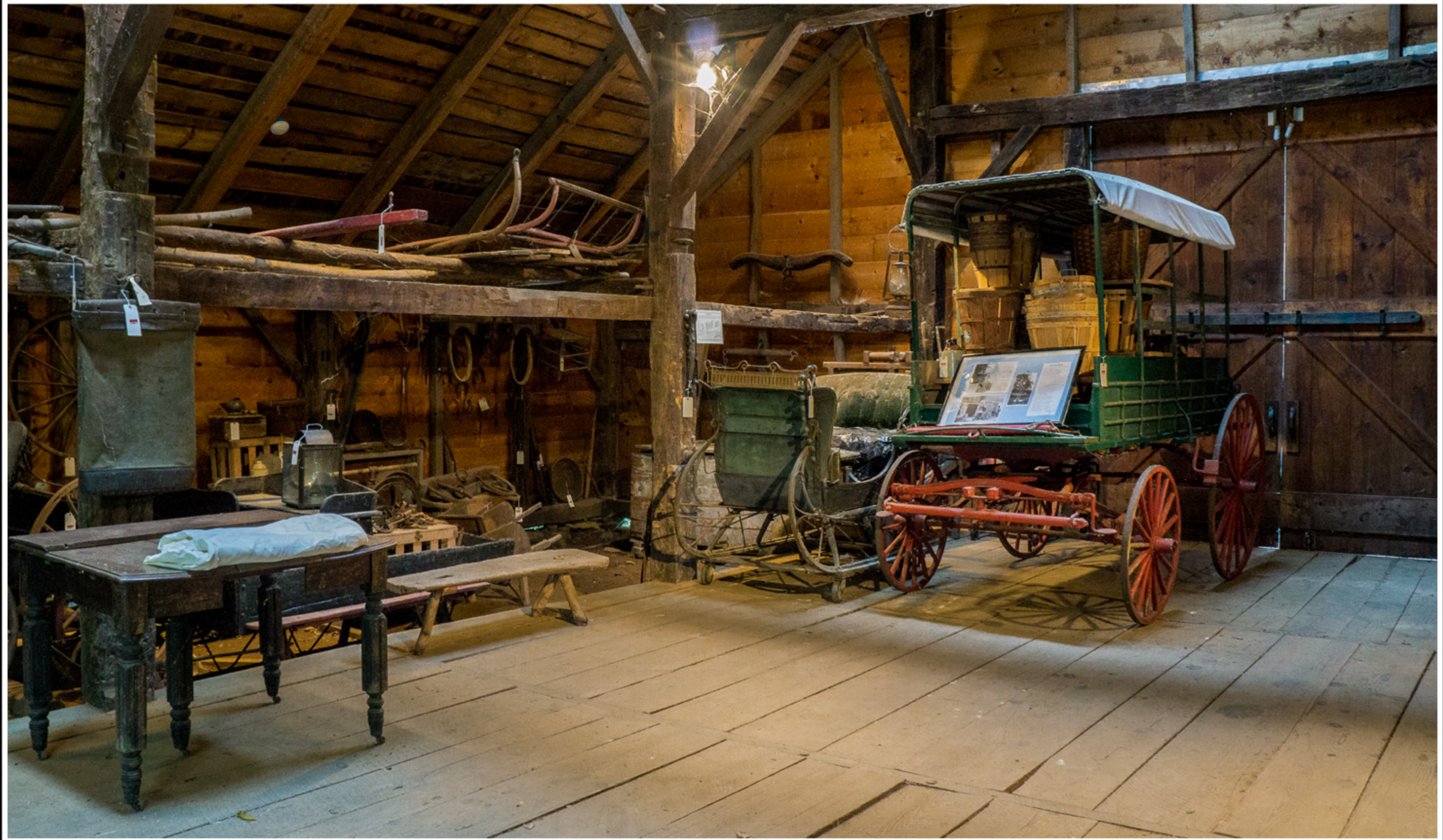
Barn: Hopper-Goetschius House Museum