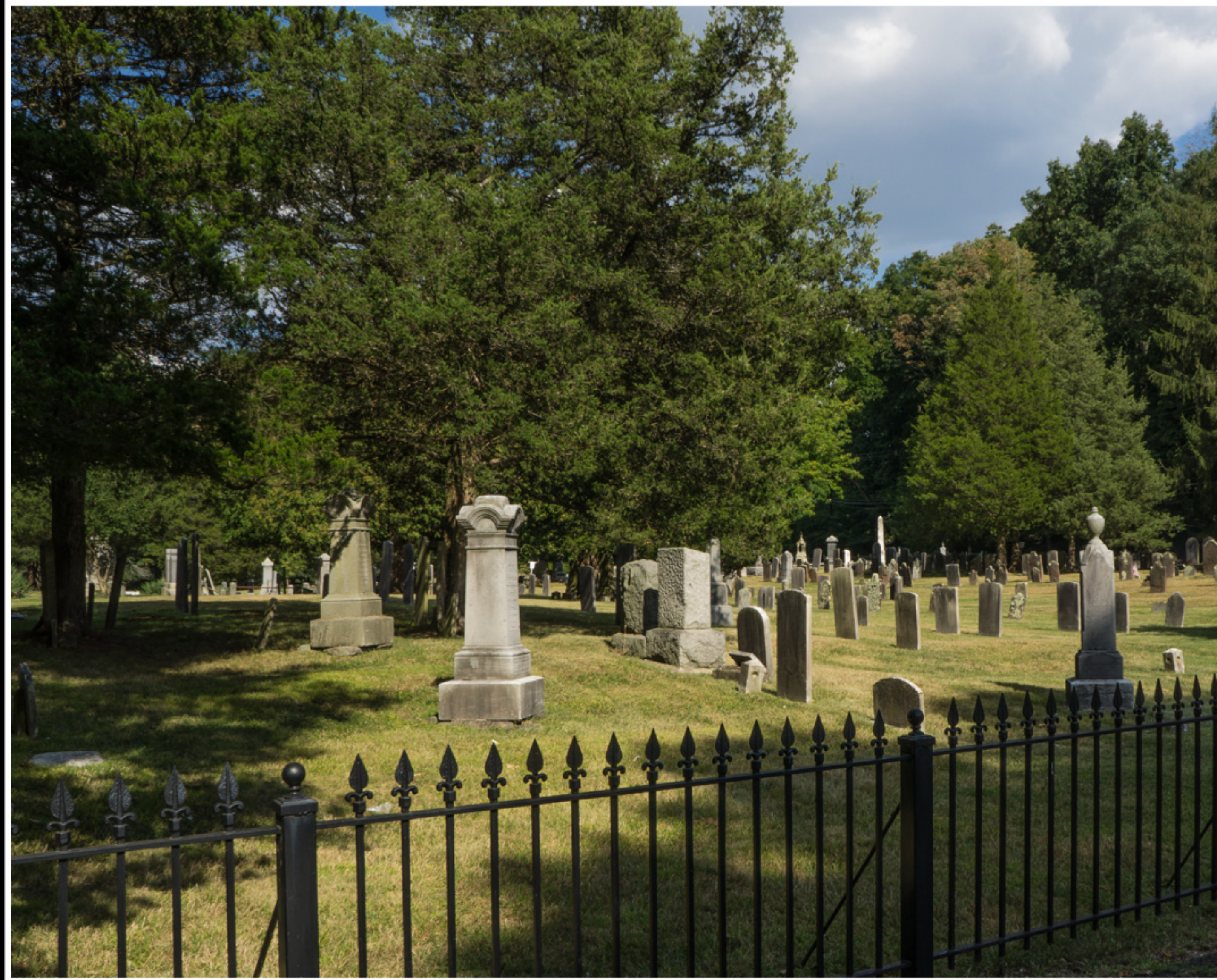
Cemetery: The Old Stone Church