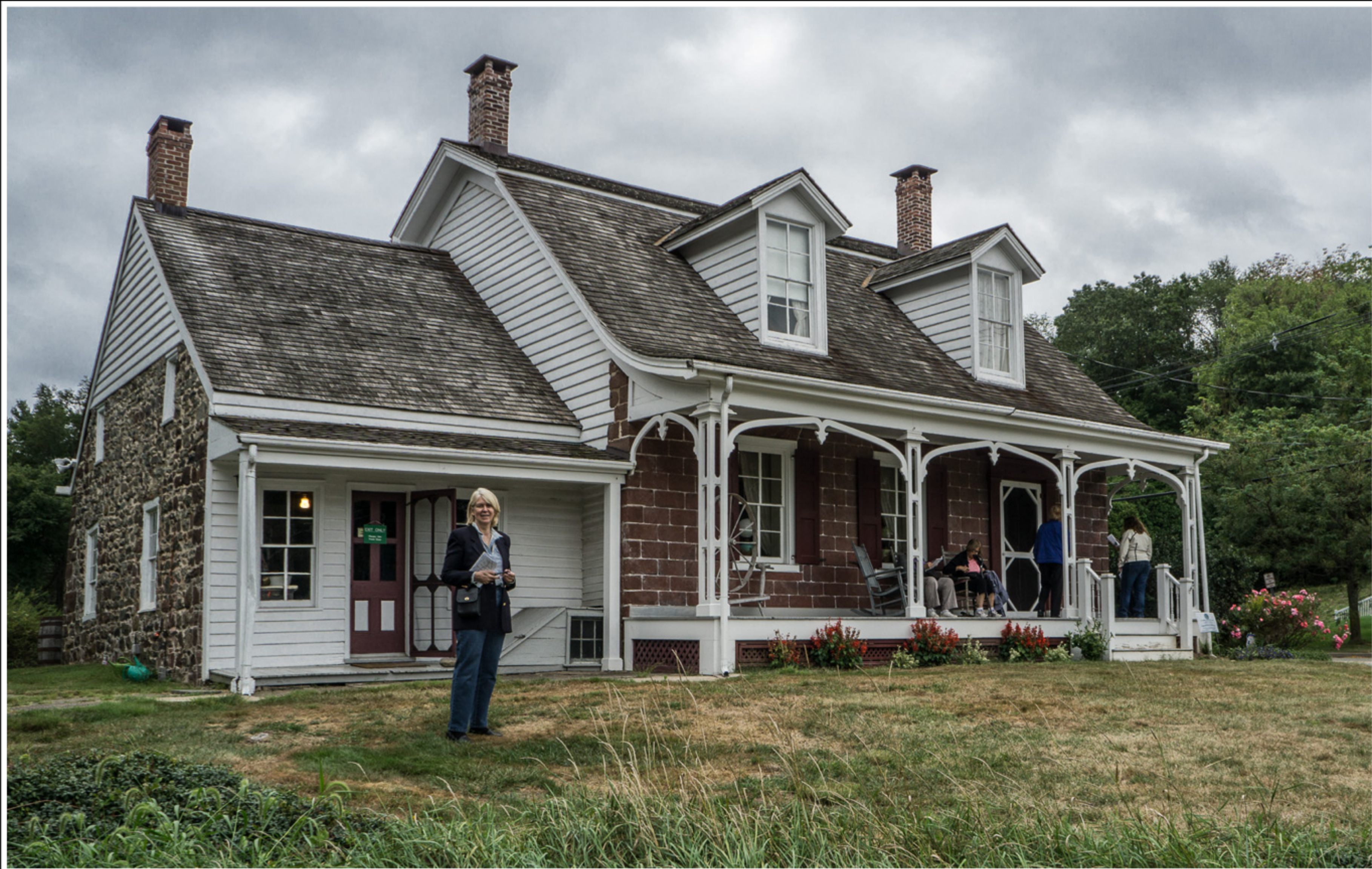
Hopper-Goetschius House Museum (circa 1790), Upper Saddle River