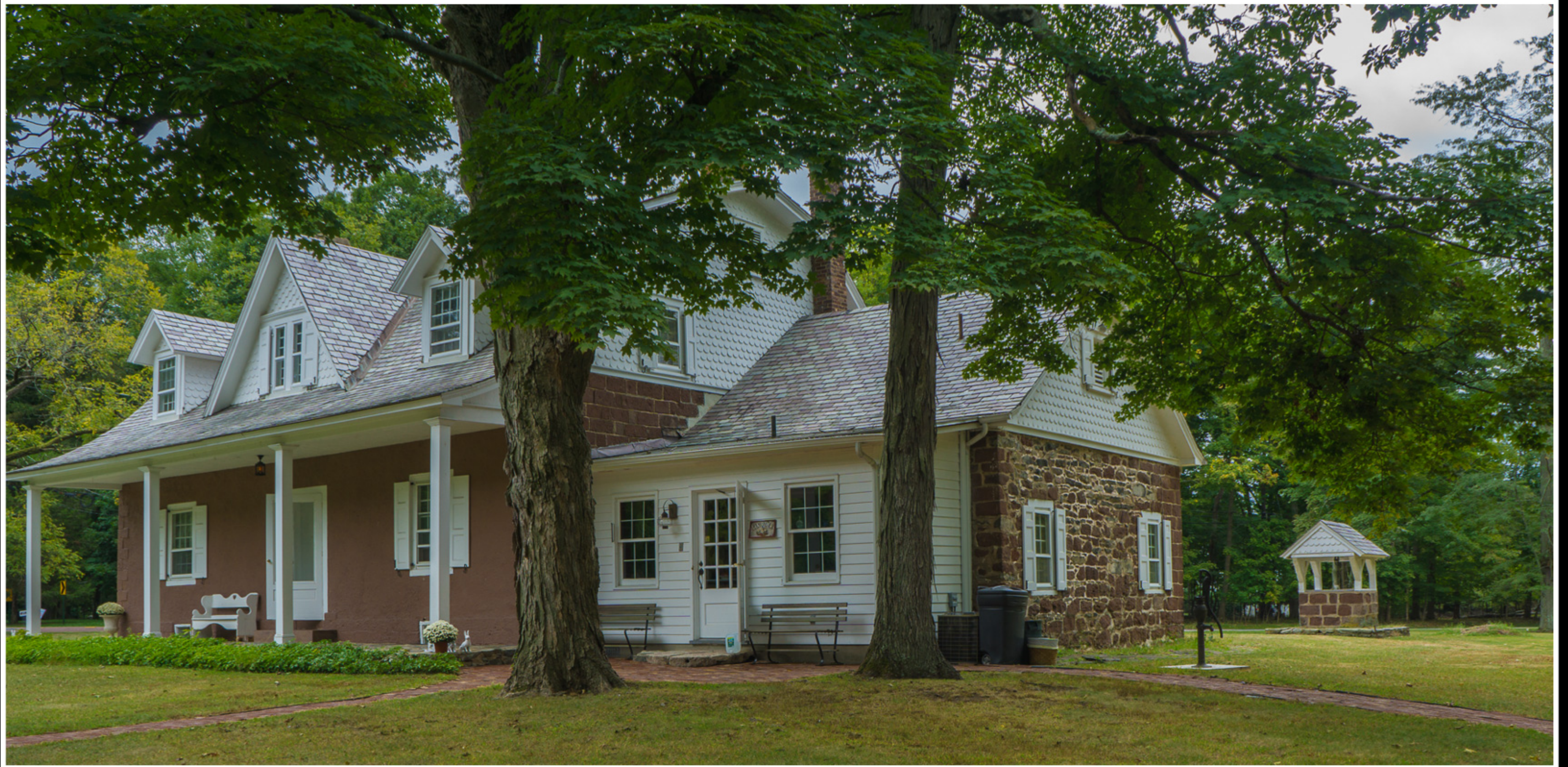
Back of Abram Ackerman House