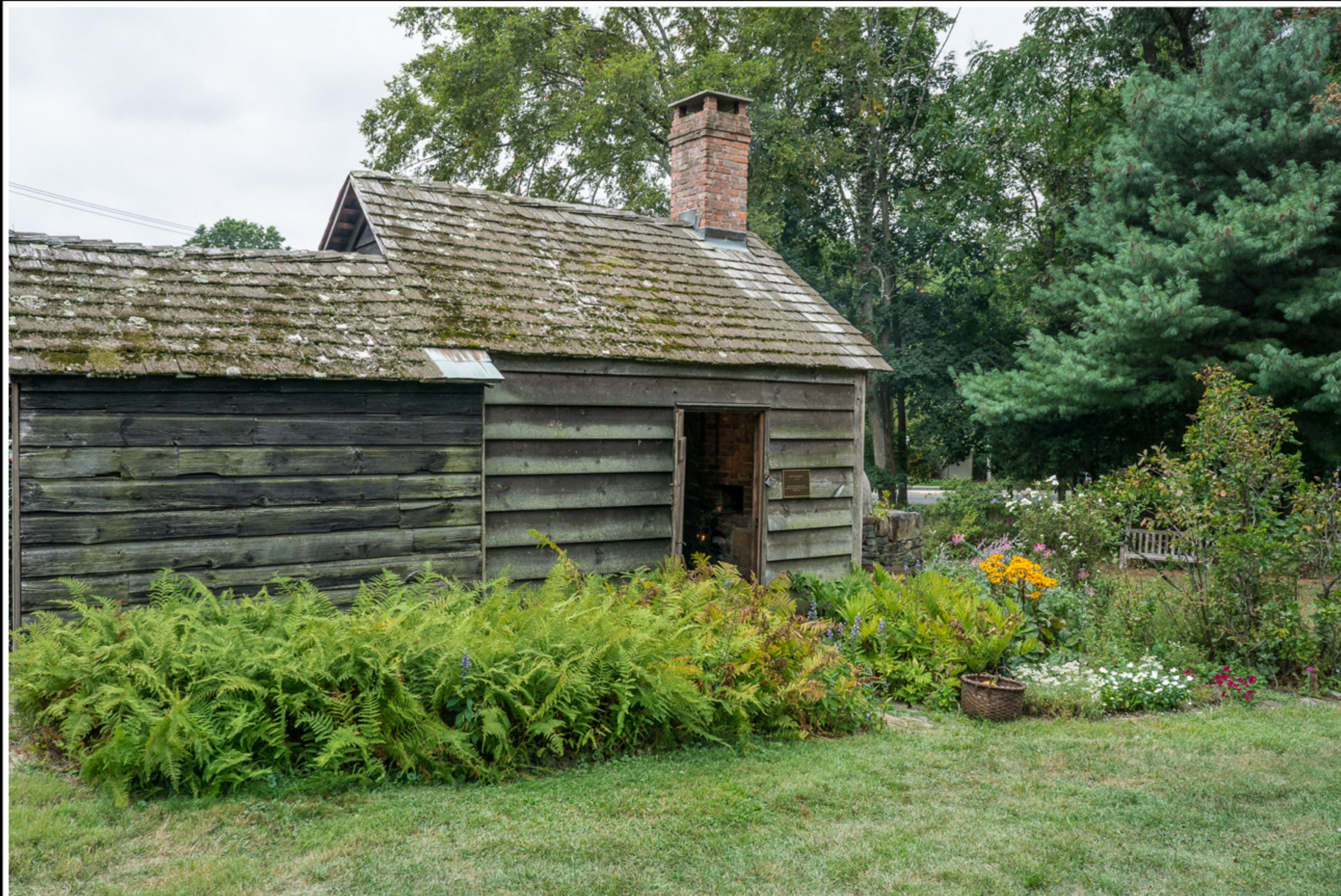
Outdoor Kitchen: Hopper-Goetschius House Museum