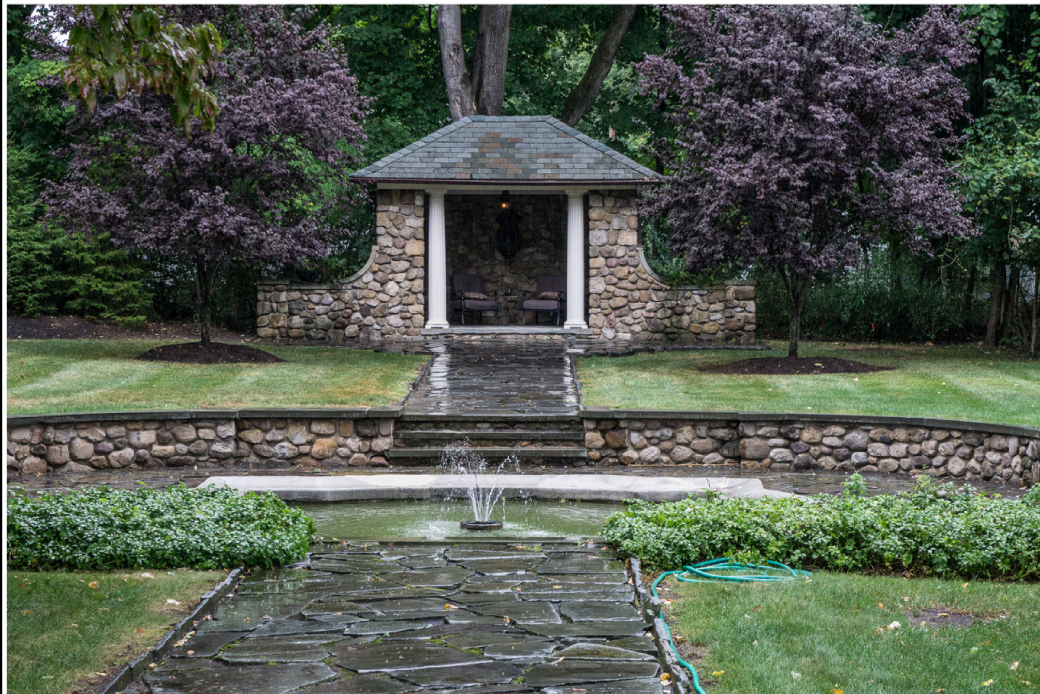
Kutzelmann-Kaufman House: Backyard