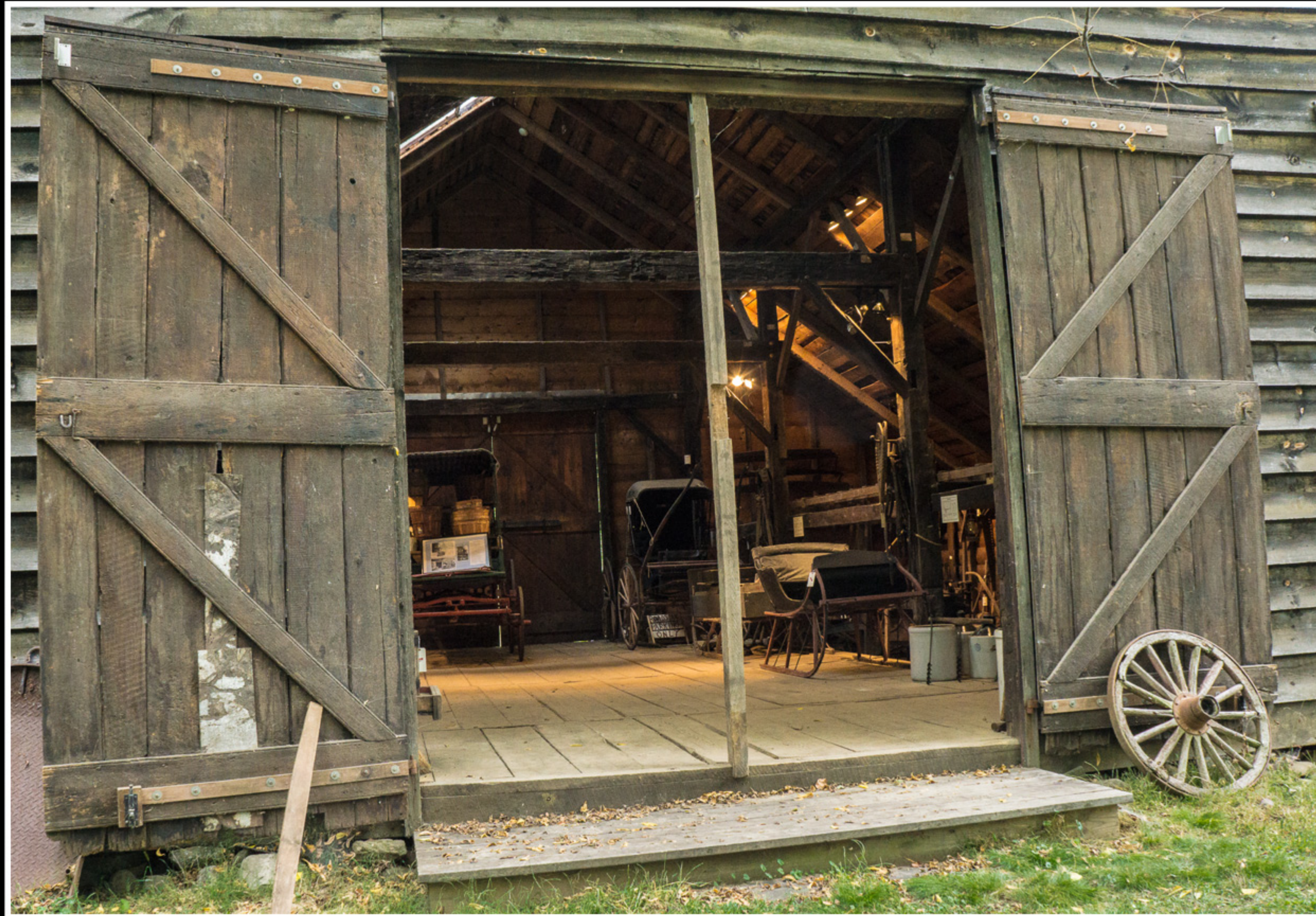
Barn: Hopper-Goetschius House Museum