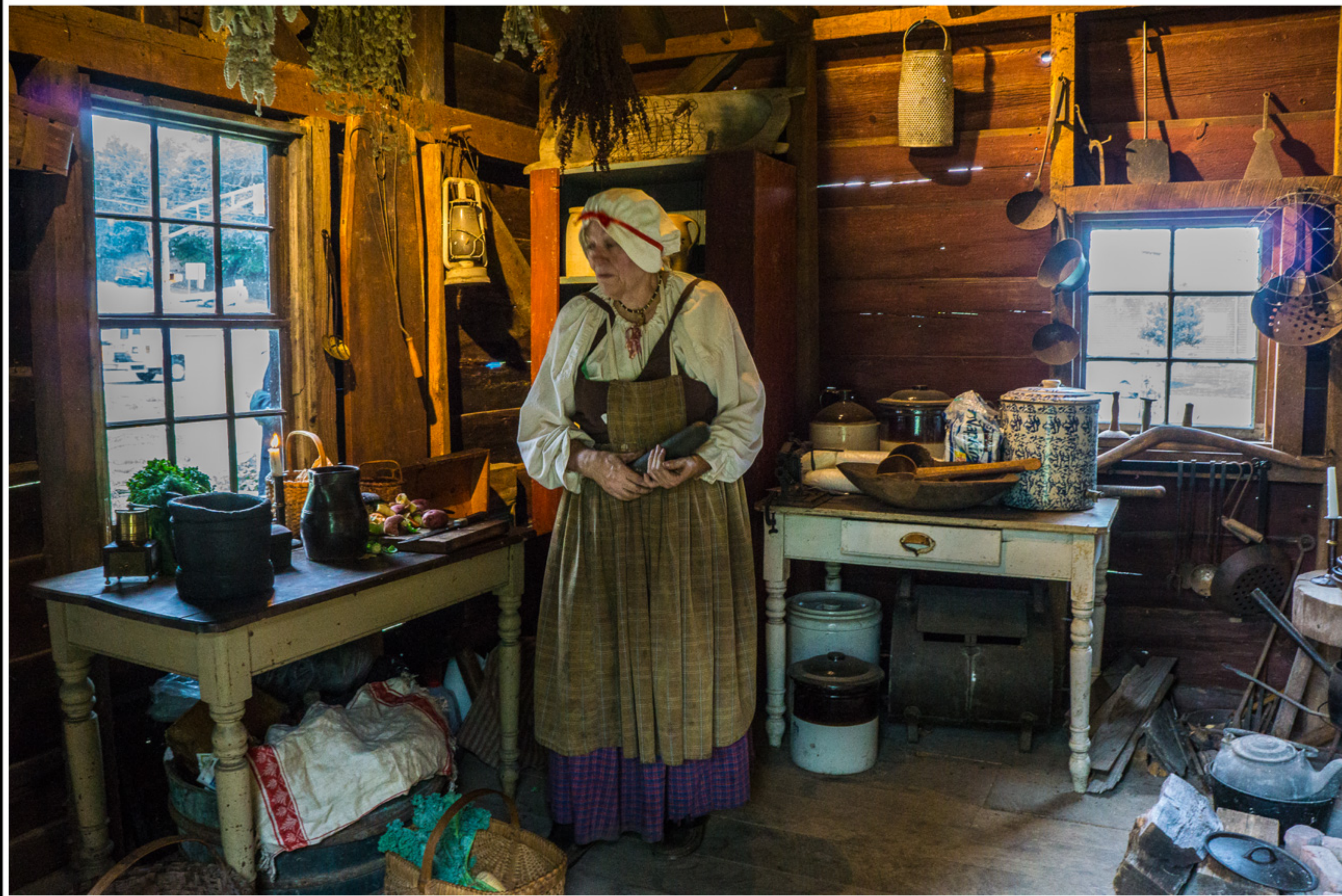
kitchen: Hopper-Goetschius House Museum