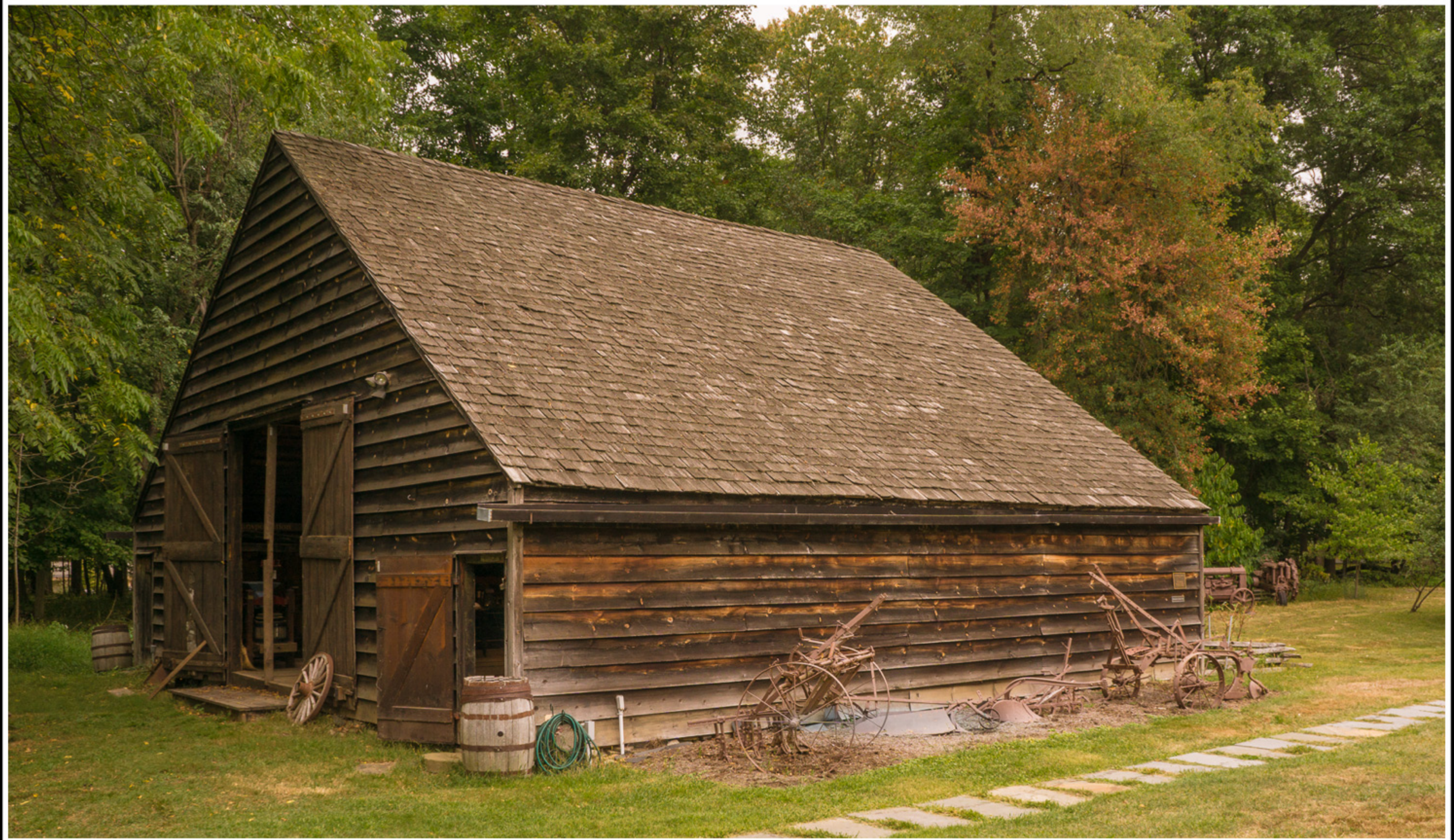
Barn: Hopper-Goetschius House Museum