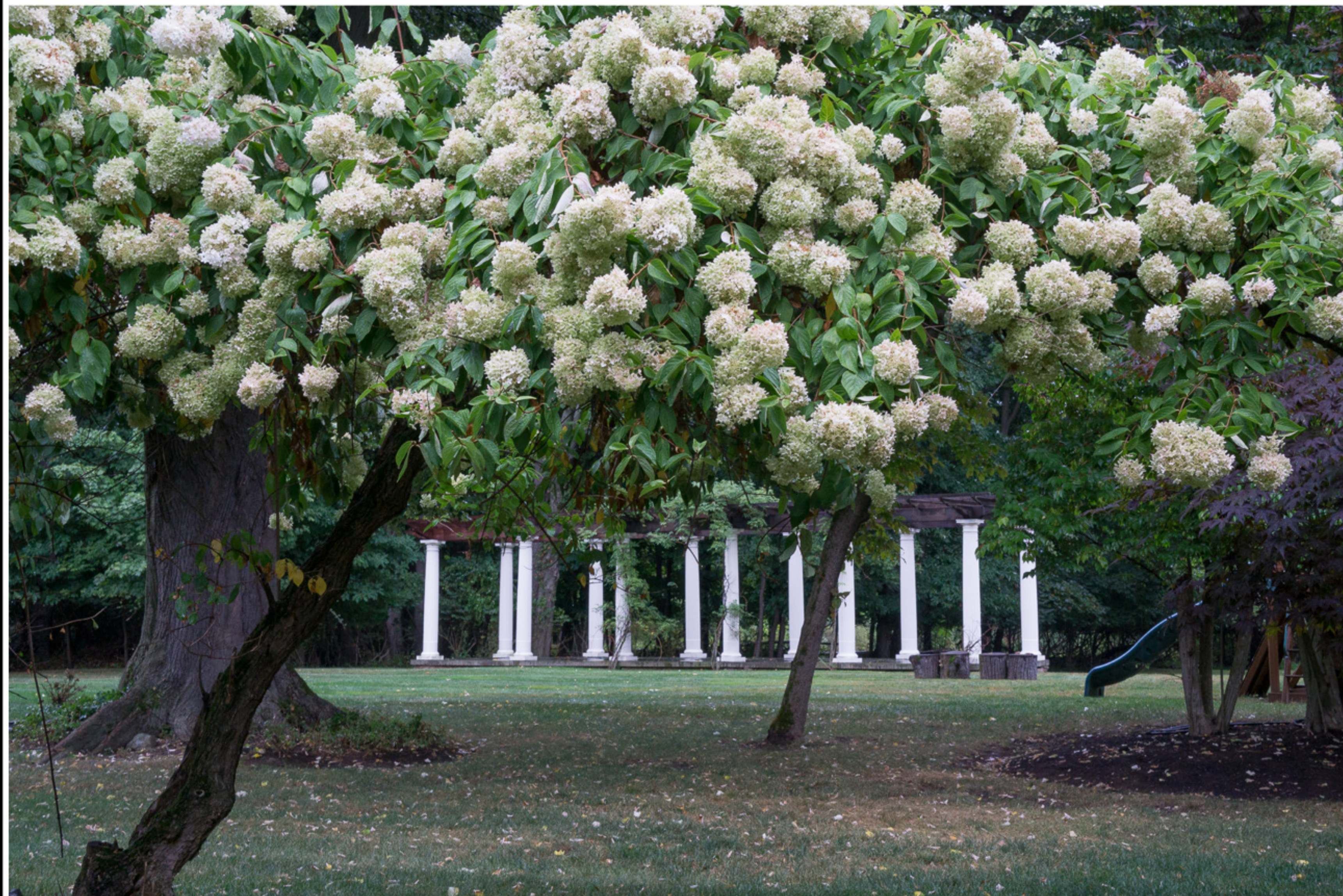
Kutzelmann-Kaufman House: Backyard