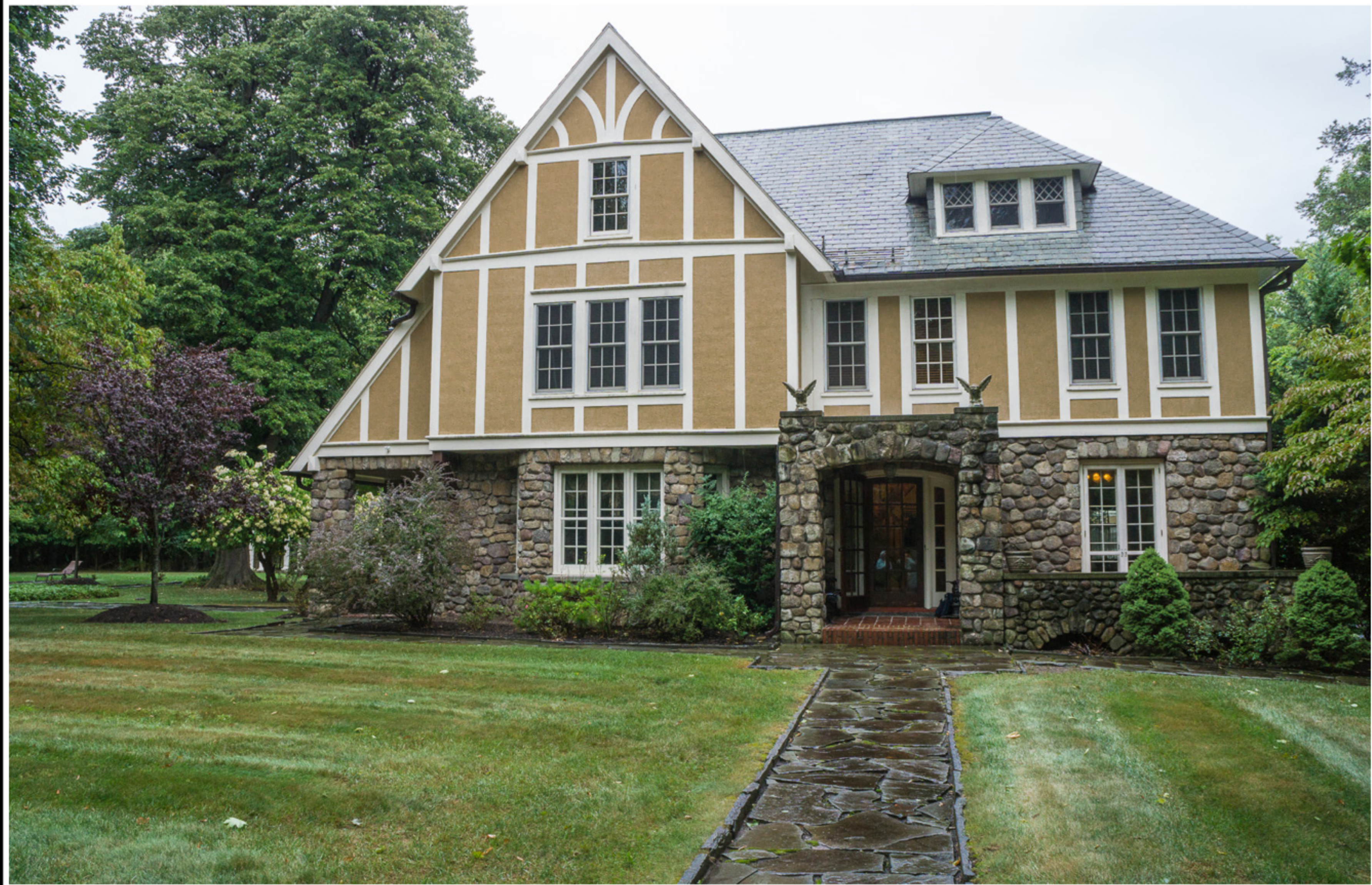
Kutzelmann-Kaufman House (1913), Airmont, NY