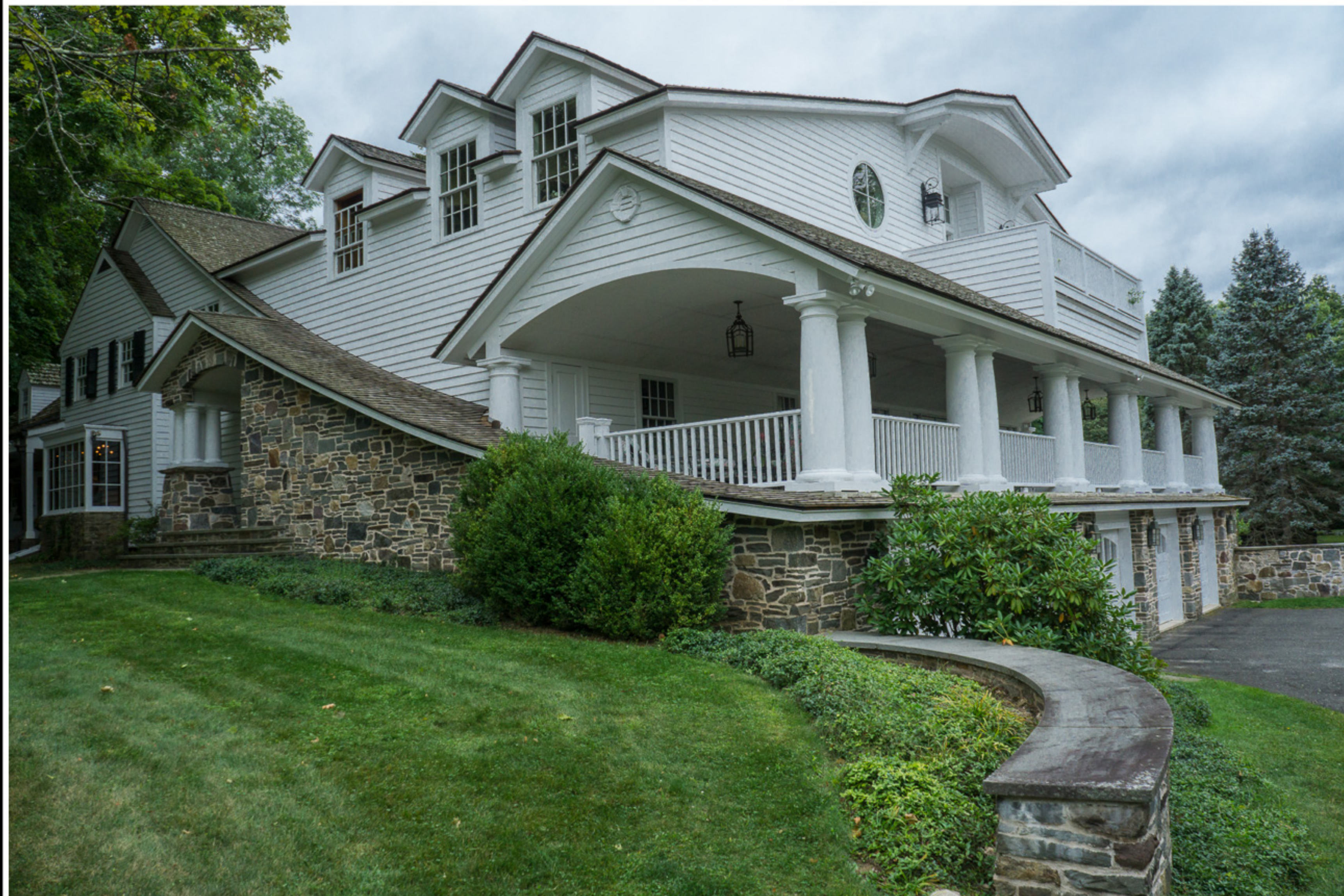
Hennion House (Victorian Addition)