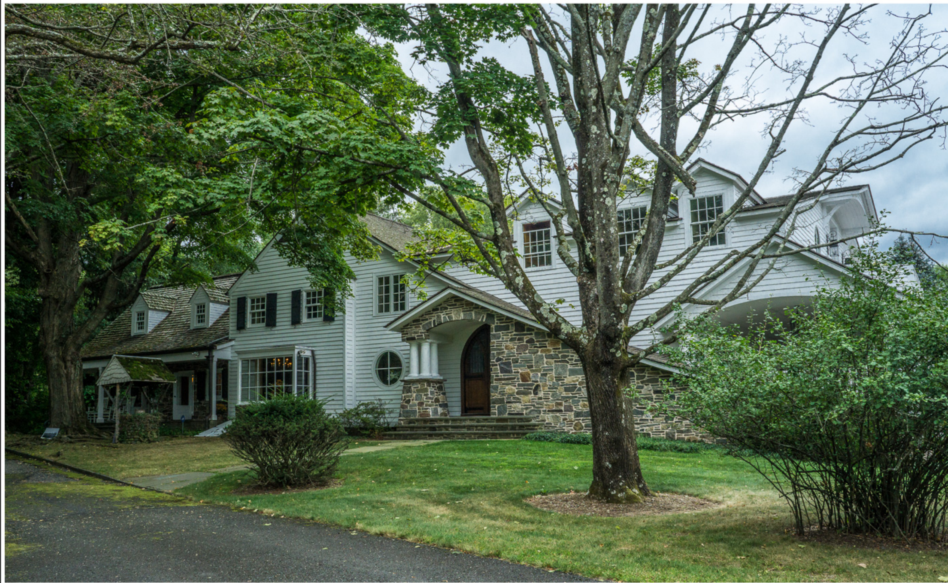
Hennion House, Upper Saddle River