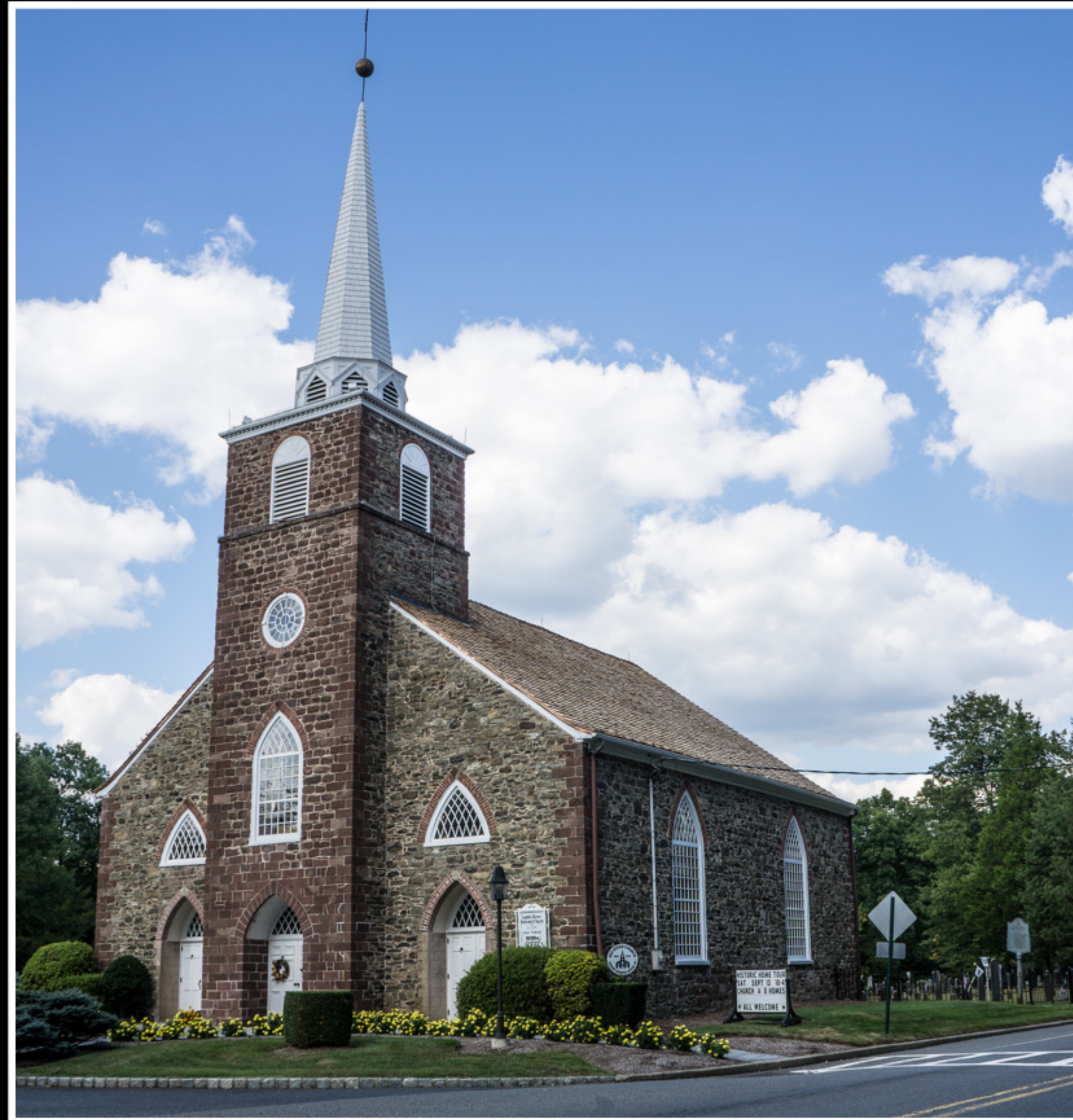
The Old Stone Church (circa 1819), Upper Saddle River