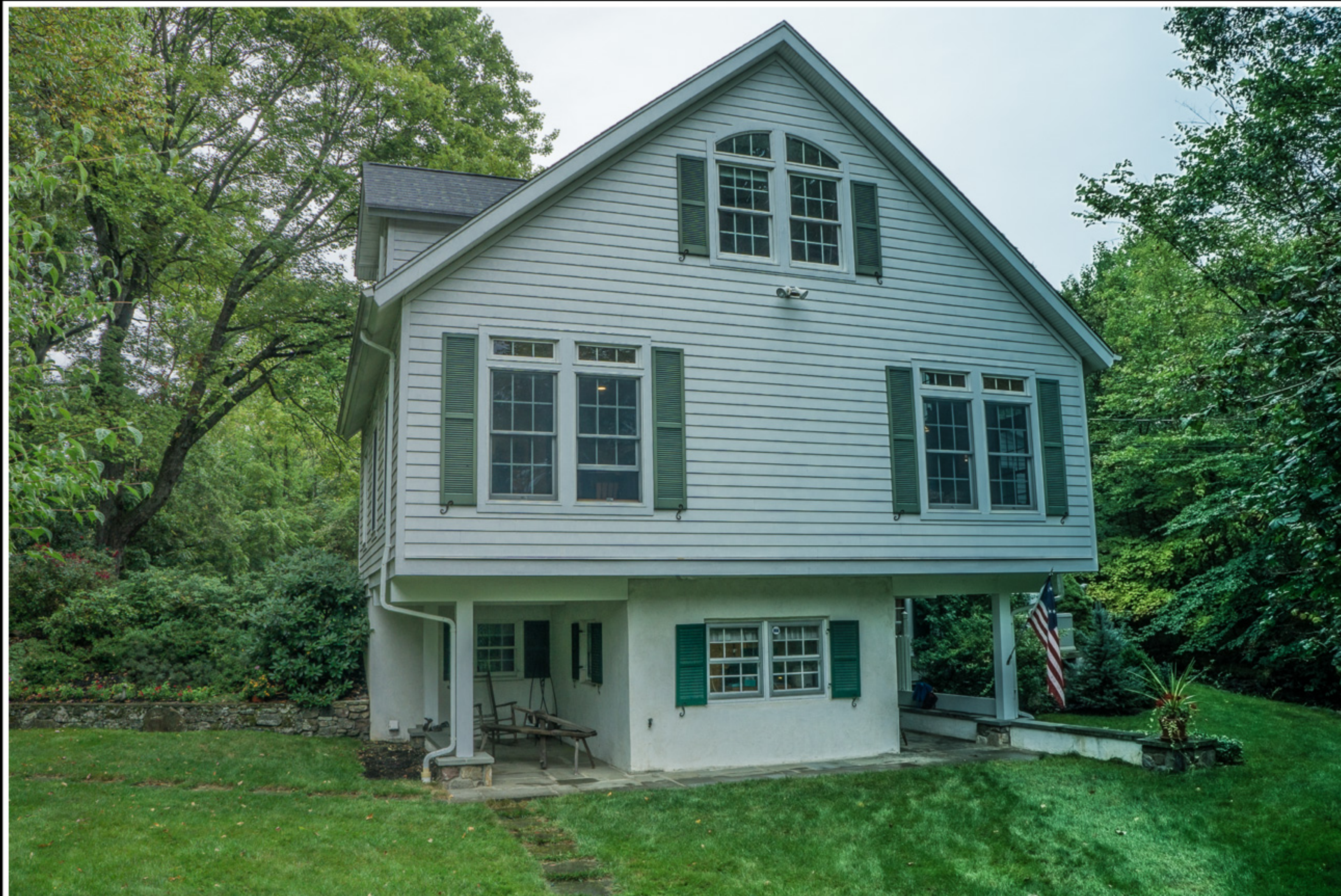
Post's Mill (circa 1800), Upper Saddle River