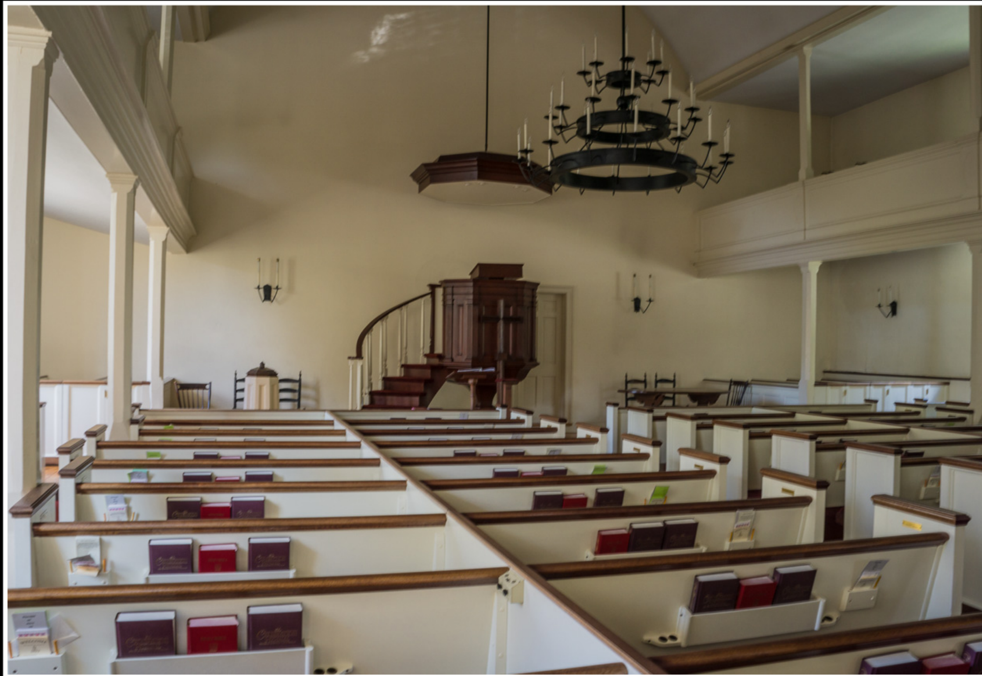
Interior: The Old Stone Church