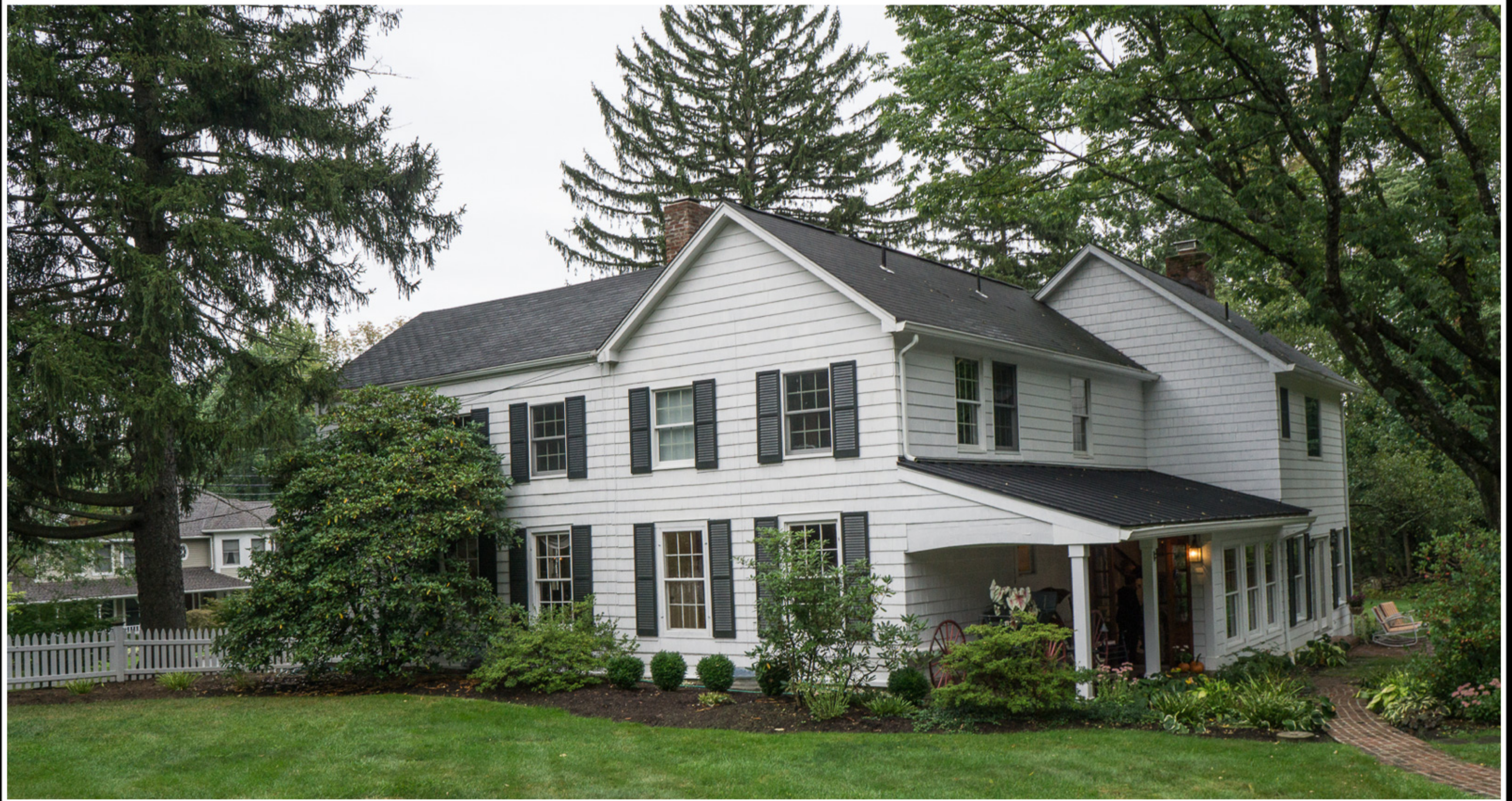
Bush-Litchult-Snyder House (circa 1820), Upper Saddle River