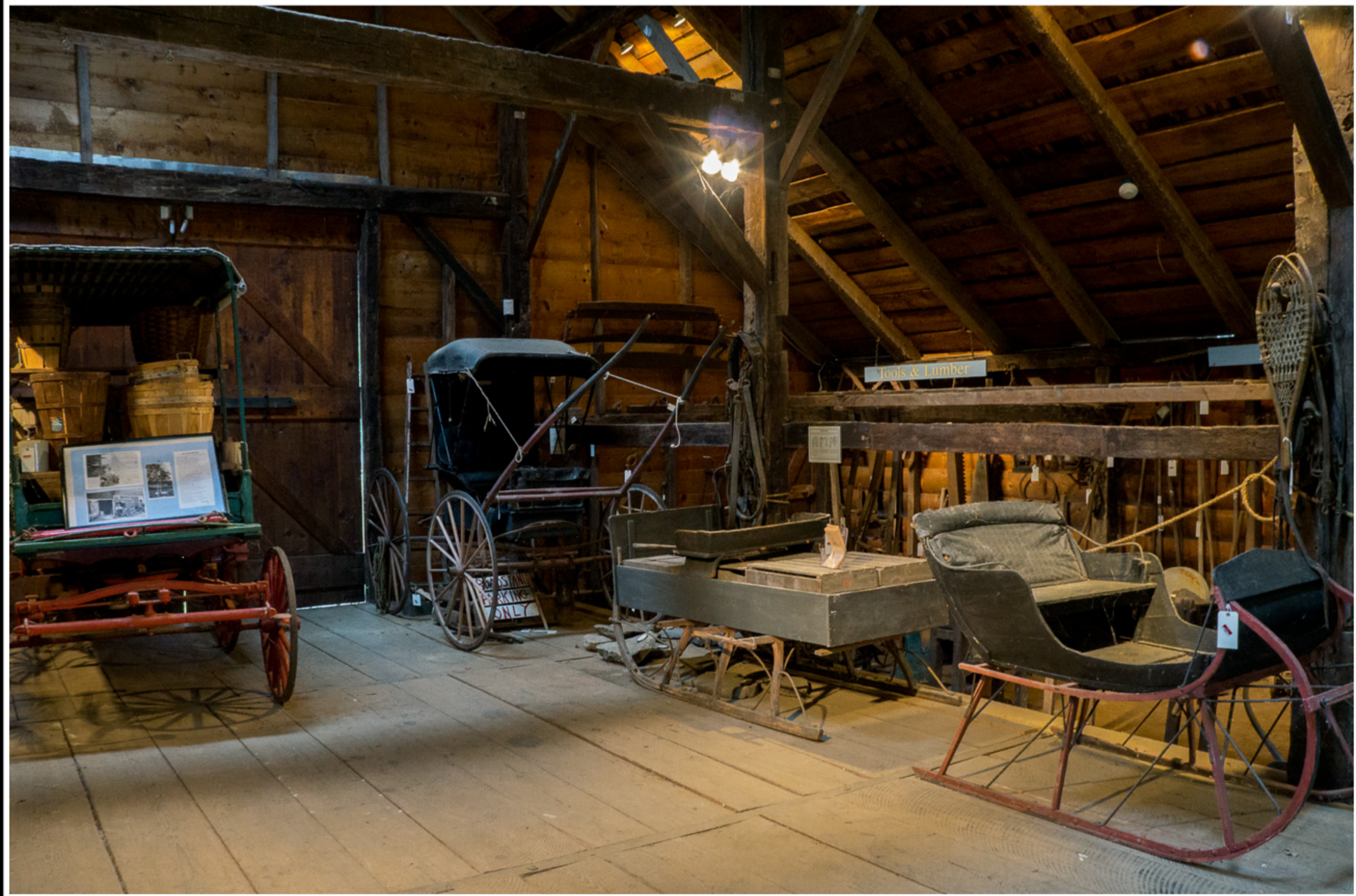
Barn: Hopper-Goetschius House Museum