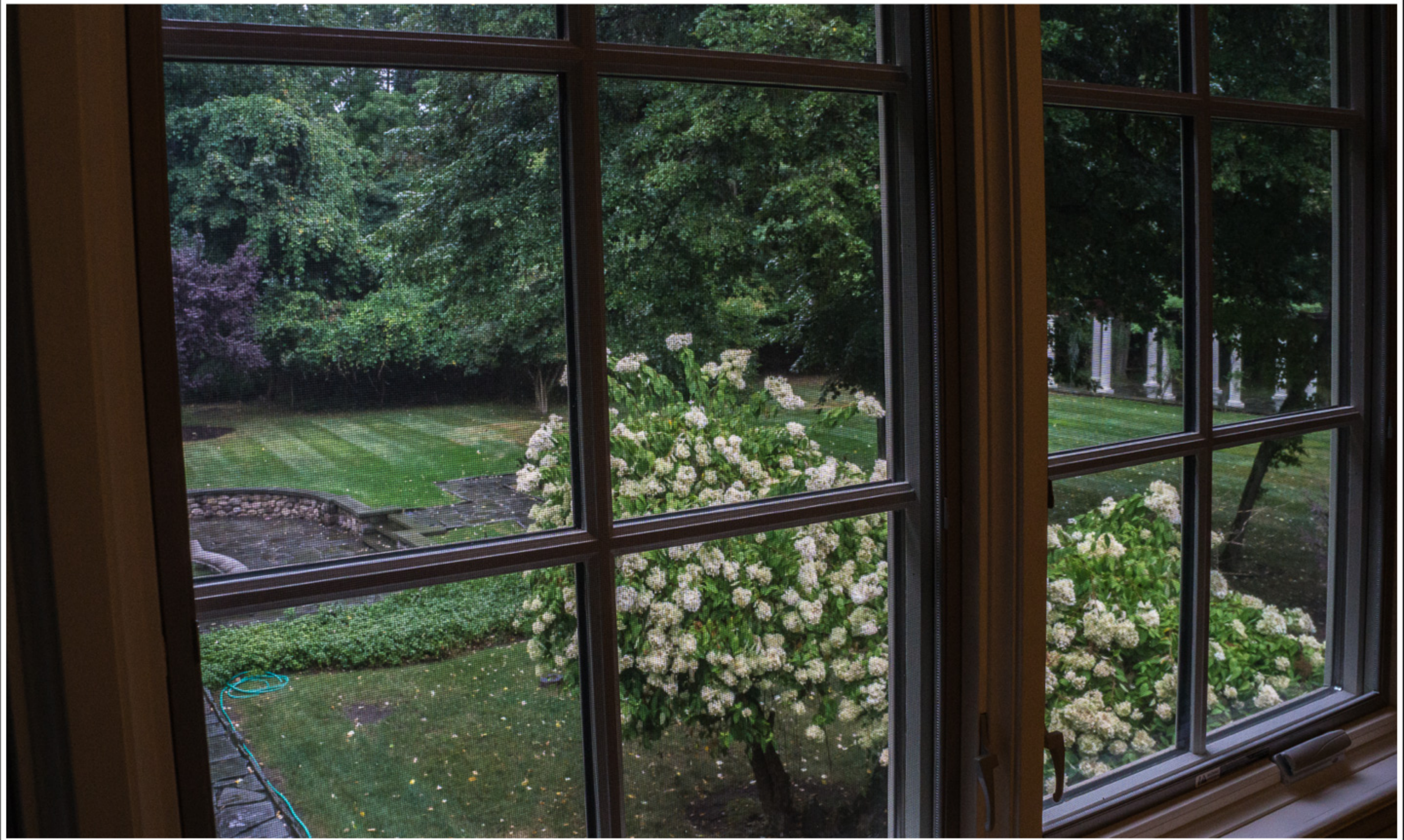
Kutzelmann-Kaufman House (2nd Fl)